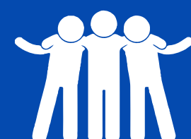
Friend 2 Friend Interactions