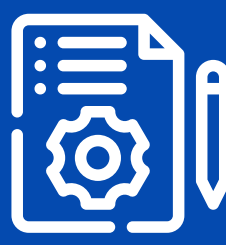
Assignment Assistance and Kit