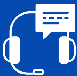
24/7 Personal Guidance